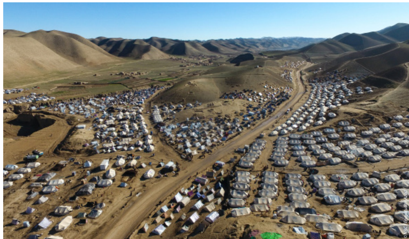
Baghdhis drone footage.